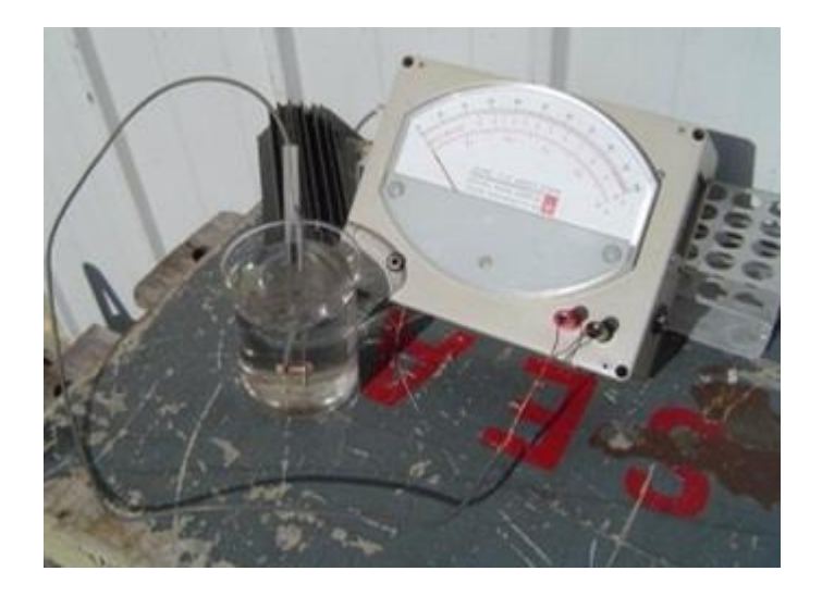
Figure 3. Prototype high impedance water purity tester and probe.