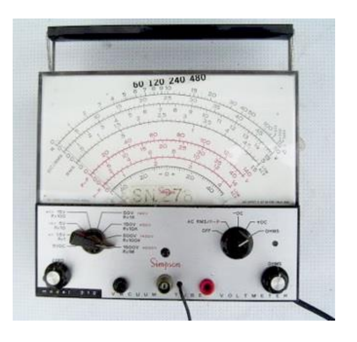
Figure 1. A typical vacuum tube voltmeter. The scale for resistance increases to the right and diminishes towards the left, which is opposite way to analogue multimeters. On this unit, the far right is a maximum value of 1,000 million Ohms.